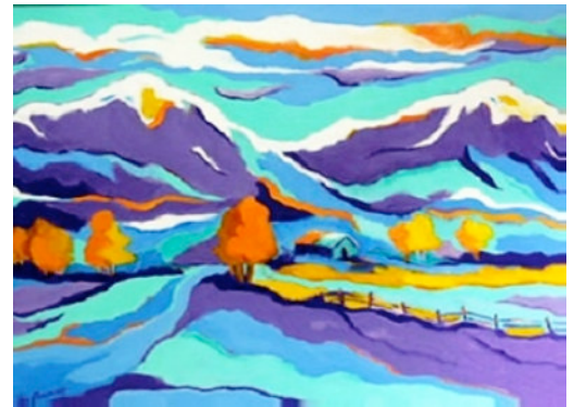
"Spanish Peaks", a 20"x30" oil painting