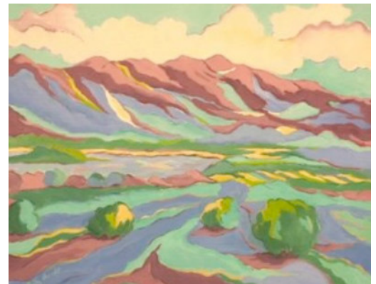
"Looking Toward Longs Peak", a 20"x24" oil painting